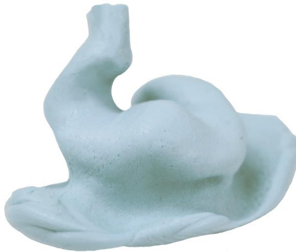
Figure 3: Example of an incomplete ear impression.